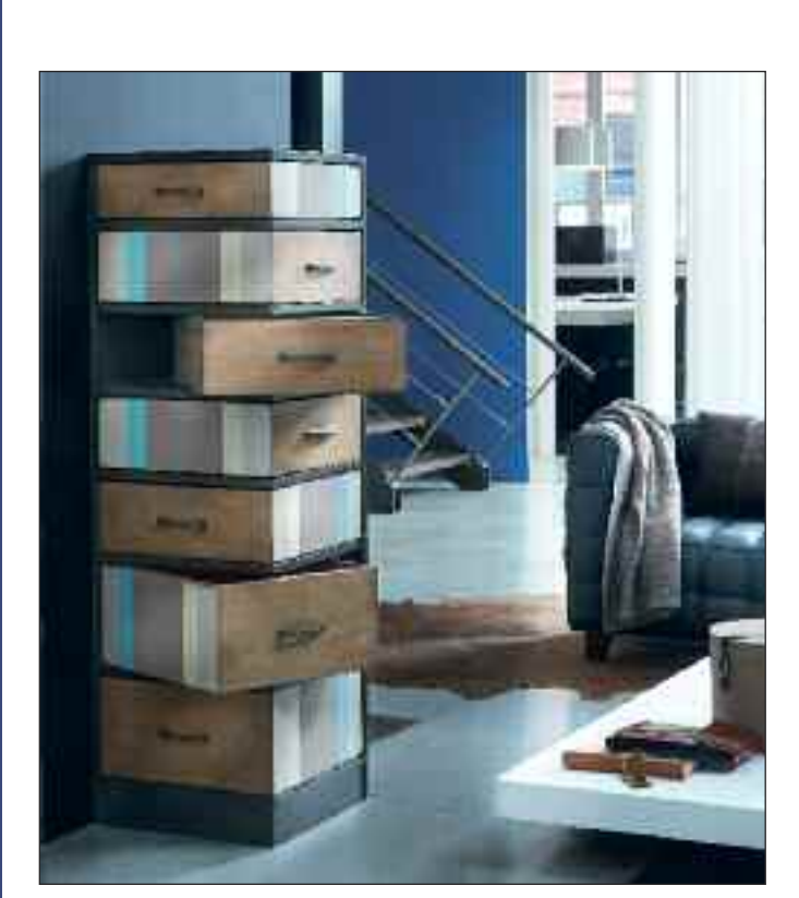
In most homes, both large and small, corners are often where space is wasted. This 7-drawer corner chest from Grange, with it's cleverly angled drawers and color options, is a perfect solution.

Interior Design • Gifts • Rugs Home Accents • Lighting